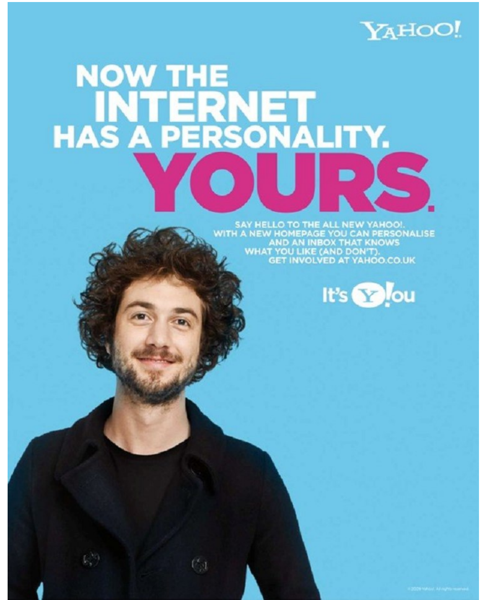
YAHOO. PHOTOGRAPHER: SEAMUS RYAN